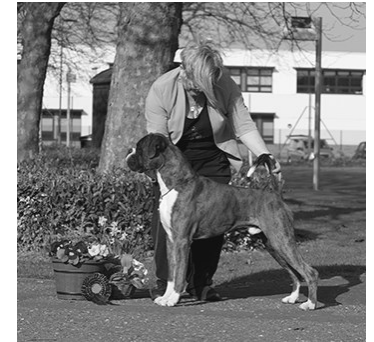
Best Puppy Dog Newlaithe Absolute Bug