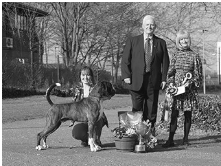
Res Dog CC and RBIS Ch Galicar Investigating With Limubox JW