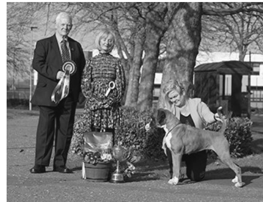
Best Veteran in Show Britesparke Luna Moonbug