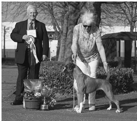
Reserve Bitch CC Ch Susancar Sheila Spire