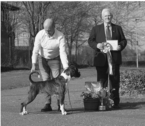
Bitch CC & Best Opposite Sex Longsdale Follow That Dream