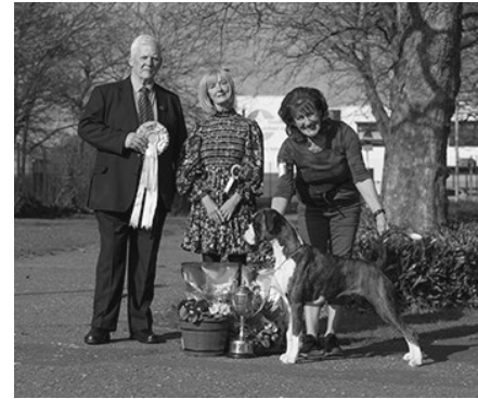
Best Puppy In Show Sunhawk Norwatch Talulah