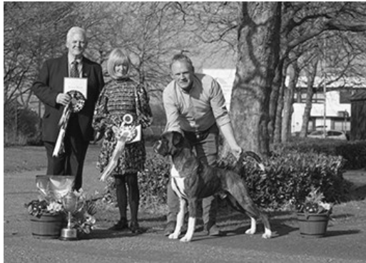
Dog CC & Best In Show Ch Lanfrese Argento